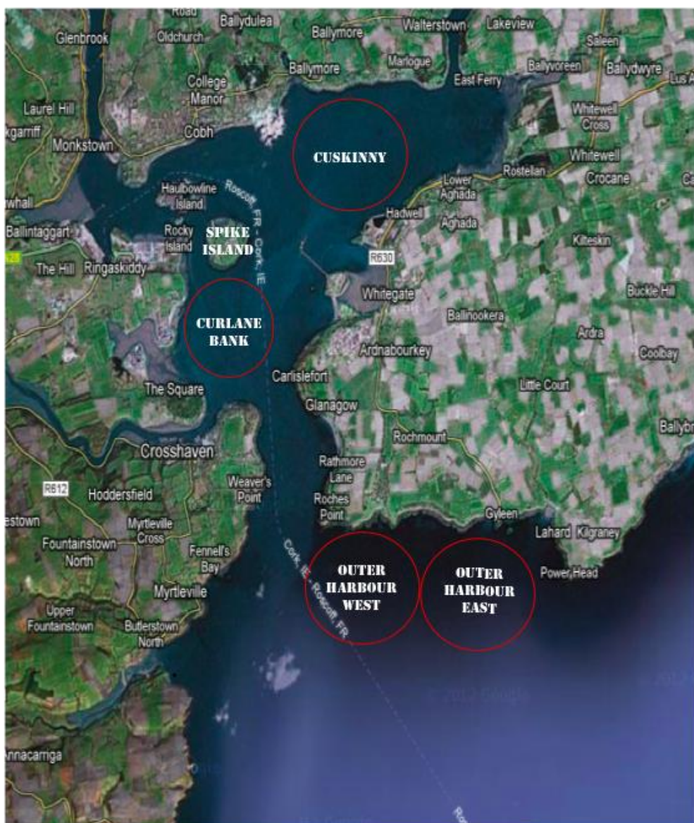
Appendix C – Race area